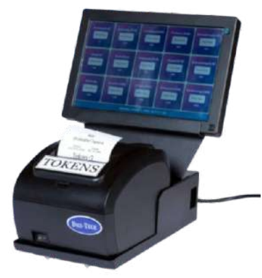
Table Top Kiosk